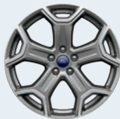
18" Machined Aluminum with Luster Nickel-Painted Spokes and Pockets Optional: Titanium