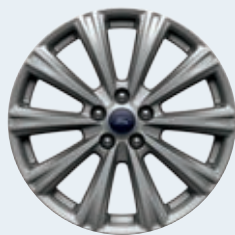
18" Sparkle Silver-Painted Aluminum Standard: Titanium