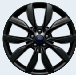
19" Ebony Black-Painted Aluminum Included: SE Sport Appearance Package