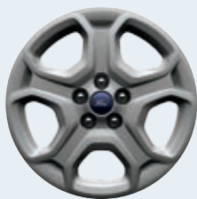
17" Steel with Sparkle Silver-Painted Wheel Covers Standard: S