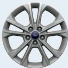
17" Sparkle Silver-Painted Aluminum Optional: S