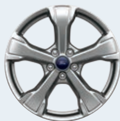
18" Ultra Bright-Machined Aluminum Available: SE